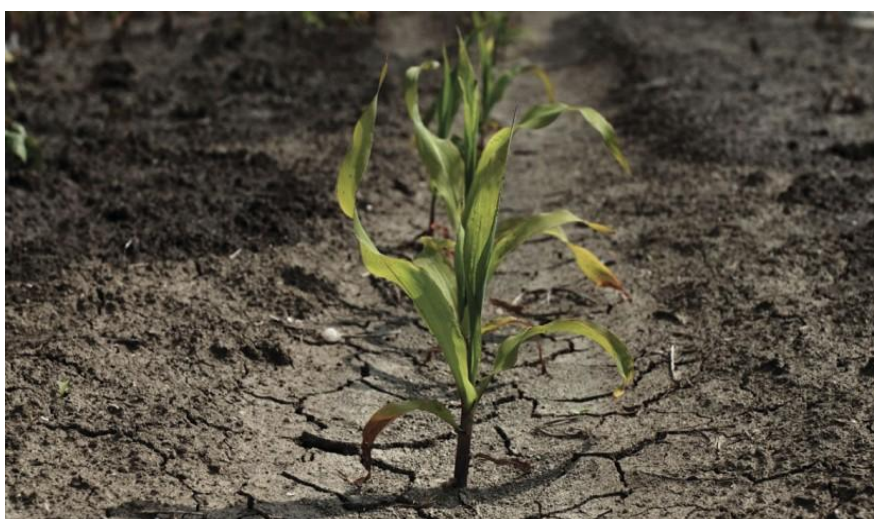
Note: Piping phase 06.07. 2021

As a visual manifestation of this, it is possible to satisfy the biometric measurements and phenological observations on the plant with the experimental variant, as a result of the prediction of the research we have undertaken under the sowing plant in the Shamakhi region of the region. [3,4]